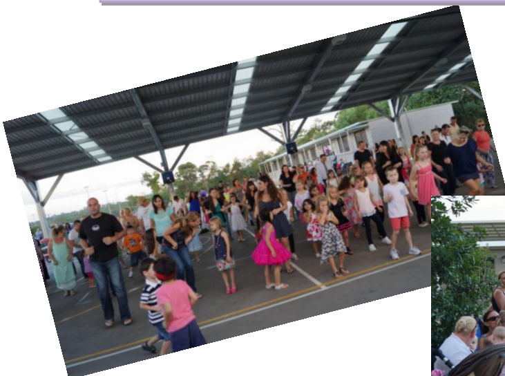
Social Night Photos

Please remember that students need to be at school by 8.50am when the bell goes. If you are dropping your children off after this time, you MUST come into the office and sign a late slip.