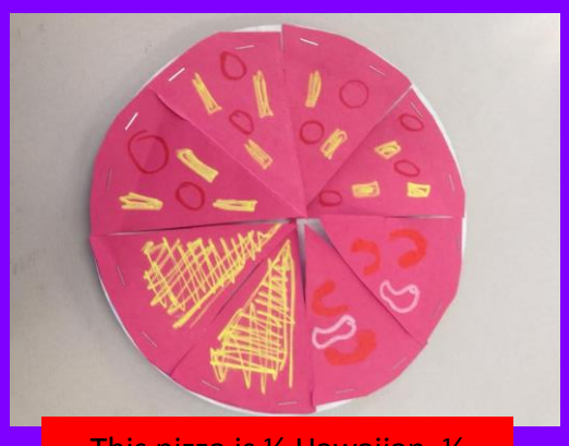
This pizza is ½ Hawaiian, ¼ Cheese and ¼ Seafood.

We have been learning about Fractions. We have been making our own 'fraction pizzas' using halves and quarters. Some pizzas were 'half' of one flavour or a 'quarter' of another flavor. We had lots of fun and everyone was very excited to be cutting their pizzas in half or in quarters. Who would have thought we would be motivated by food?