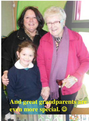
And great grandparents are even more special. 😊

Blessed are those who snuggle and hug, spoil and pamper, boast and brag...for they shall be called Grandparents!