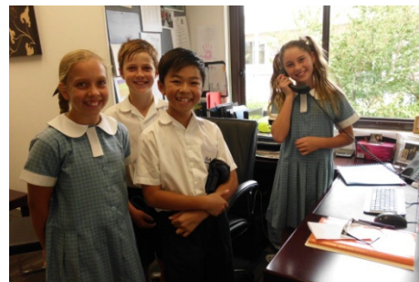
Excited captains and vice captains calling parents with their 'news'.