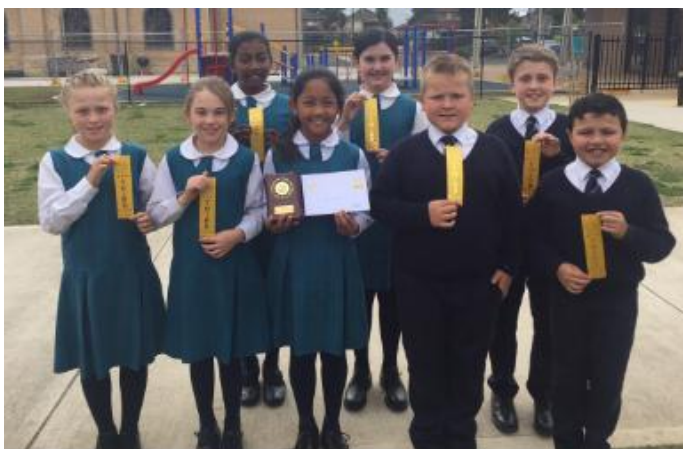
Year 4/5/6 Choral Recital at the Hawkesbury Eisteddfod today – third place.

If you have any ideas or are interested in helping out in any way for any of the upcoming events please email olapfc@gmail.com