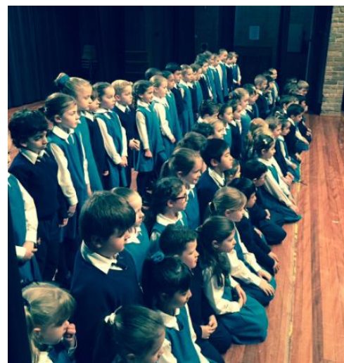
Year 1 looking nervous but splendid at Hawkesbury Eisteddfod