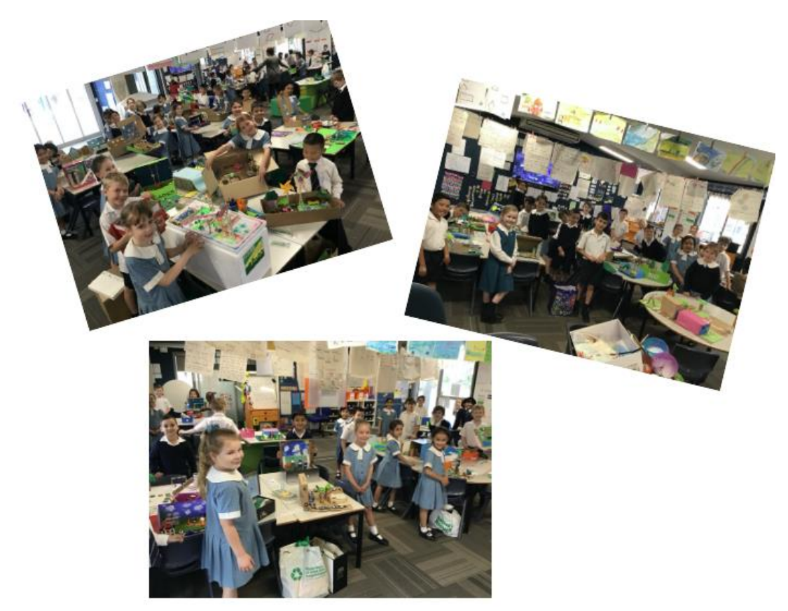
TECH TIP WEEK 9

Year 1 had a great session today making their new playground for Rouse Hill. The children were very creative in their designs. Many had cafes for the parents, trees for shelter, benches for resting, play equipment for the kids to have fun and even soccer fields, bike tracks and toilets. They thoroughly enjoyed creating today and describing their different features.